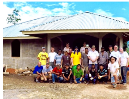
Building team and progress at the end of the week.

transformer to bring power to the property, yet there are a few hurdles to be overcome in order to connect. Please pray specifically for this. Currently, a well for water is in construction.