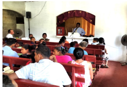
Our first Sunday morning service at the new location

Another big "Thank You" to those who recently gave towards our engine overhaul and vehicle repairs. After two months without a vehicle, we traveled to Managua to pick up our 4Runner in May. The motor is running well and many additional repairs were