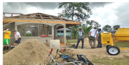
Beginning of the week...

God's direction, protection, and provision in this endeavor.