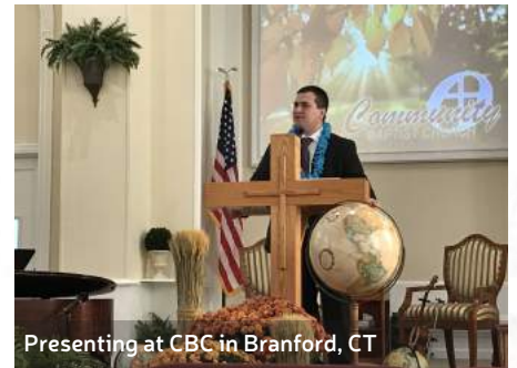
Presenting at CBC in Branford, CT