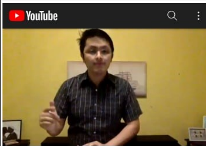
MZBMP Wednesday Bible Study (2 Tim. 3:1-5) Unlisted 2 watching now 0 Dislike Share Save Report

Independent Baptist Missionaries to Taguig City, Philippines sent by Mt. Zion Baptist Church, Brogue, PA.