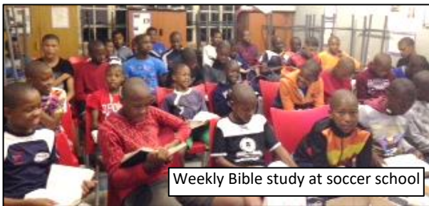
Weekly Bible study at soccer school

My mother would have turned 87 on October 2, and this was the first year she was not able to bid me a Happy Birthday. How does the physical birth picture the spiritual birth?