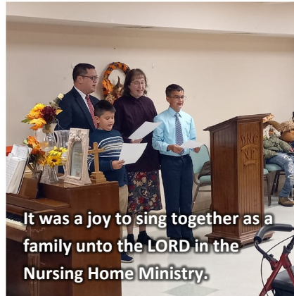
It was a joy to sing together as a family unto the LORD in the Nursing Home Ministry.