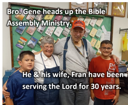
Bro. Ed heads up the Bible Assembly Ministry.