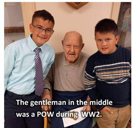
The gentleman in the middle was a POW during WW2.